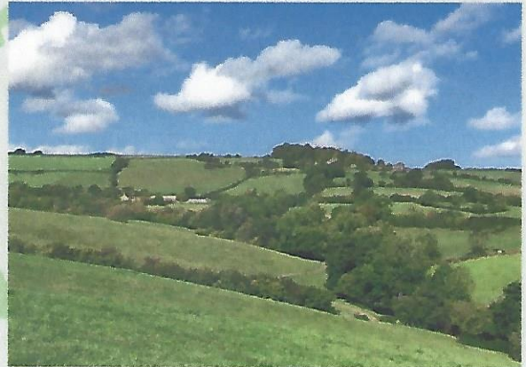
Hamswell Valley: The Hamswell Valley is a typically beautiful section of the Cotswold Way