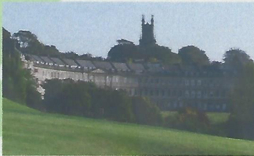
Lansdown Crescent: Just one of the many impressive buildings in Bath