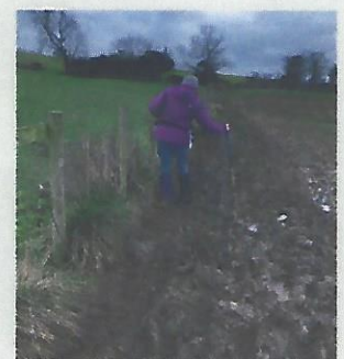
Improvements to muddy footpaths cost £15 per sq/m

Your donation will help us keep the Cotswold Way accessible to all. To give, either visit our website or scan the QR code.