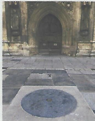
Start and finish: Bath Abbey West Door marks the start and finish of the Cotswold Way