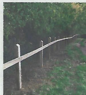
Installing new handrails costs £200

We are a registered charity dedicated to; repairing, maintaining and improving the Cotswold Way, and increasing accessibility for all. We work closely with Cotswold National Landscape, appointed by Natural England to manage the Cotswold Area of Outstanding Natural Beauty.